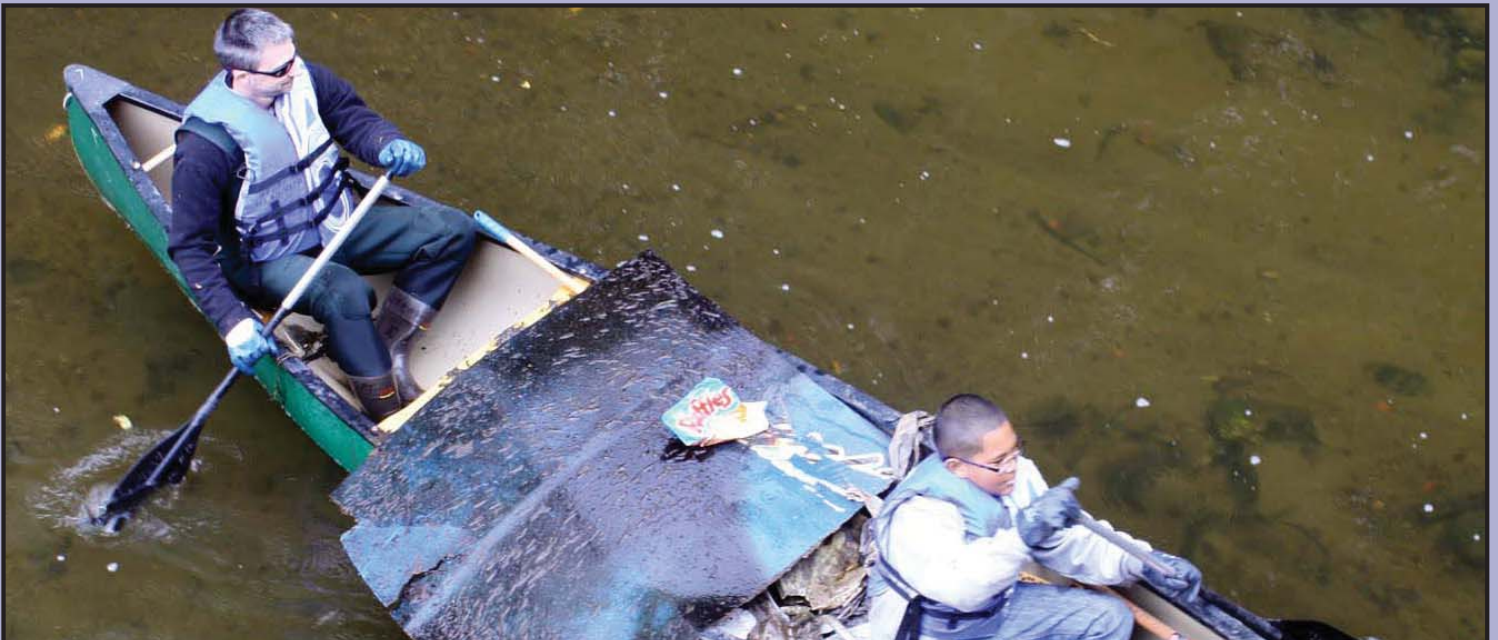
Junior ROTC members are a vital part of the clean up