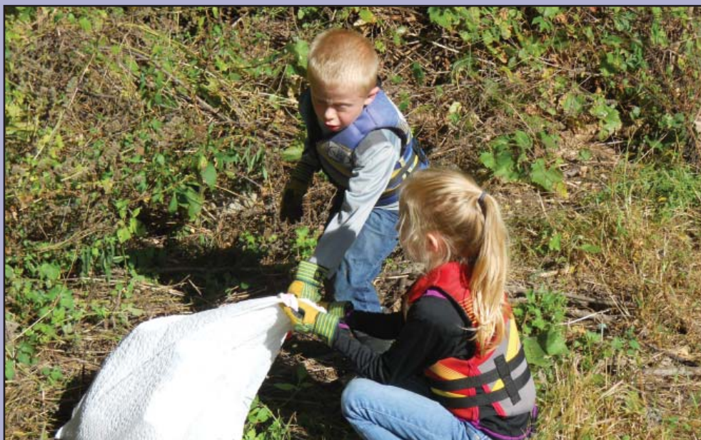
Everyone does their part during the cleanup

Even with low water levels, for the fourth year in a row we have seen a decrease in the amount of trash collected from the Grand River.