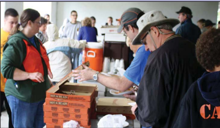
A very hungry crew devours lunch that is served after the cleanup.