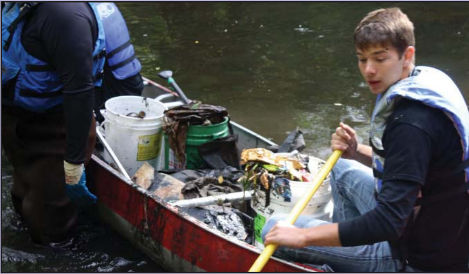
Debris taken out of the river