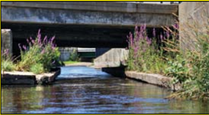
Mechanic Street Bridge Over the Grand River