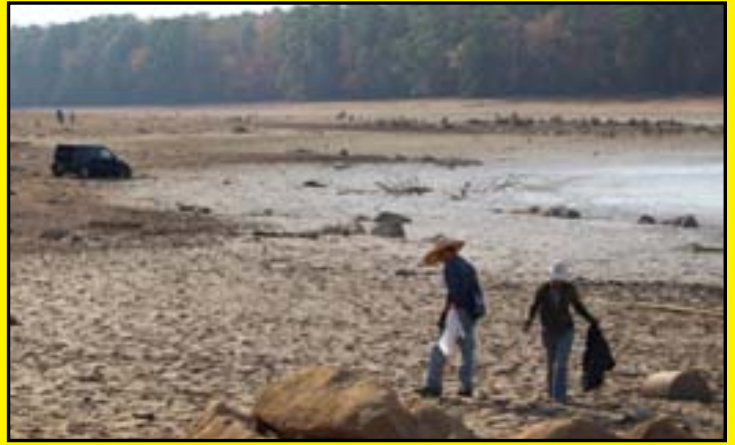
More than 200 volunteers participated in cleanup day at Lake Purdy.

In Michigan we share concerns with our fellow Americans in the south, such as water quality, E. coli, access to water resources, and impact of land development. One concern we do not share is a reliance on man-made impounds for our drinking water. Our 'impounds' (Lake Michigan and Huron) are a blessing we seldom think about. Water, like air, is only a concern when absent.