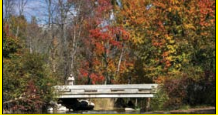
Bridge on Park Rd. Between Sharp lake and Grand River