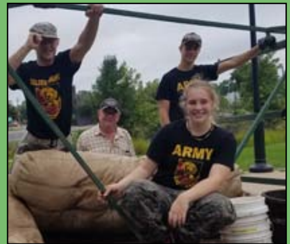
Junior ROTC volunteers with river debris.

The morning of September 10, 2016 started out at 65° and a light rain turned into a cloudy and windy 70° at 1:00 p.m. The weather did not dampen the spirits and enthusiasm of our 92 volunteers, which included 6 board members, 1 granddaughter, 20 from CMS Energy, and 58 from the Junior ROTC. Warm donuts from Hinkley Bakery and hot coffee from the Jackson Coffee House arrived soon after the volunteers at the CMS Parking Garage for registration and team assignments. Three teams consisting of trailers with eight canoes each and junior ROTC members for unloading the canoes and gear were sent out to spot the canoes and gear at six different locations along the Grand River. At 9:00 a.m., six teams were formed, assigned their equipment, and transported with their team leader to the canoe drop off locations thanks to the buses and drivers provided by the Dahlem Center, Jackson Career Center and the Jackson Area Transportation Authority. Depending on water depths in the river, these teams would wade in river using the canoes as garbage barges or paddle the canoes while placing the collected trash around themselves in the canoes. Two teams formed by CMS Energy and Junior ROTC volunteers walked the banks of the Grand River, from Washington Street to Monroe Street, placing and carrying the debris they picked up in burlap bags and returning it to the CMS Energy Parking Garage. Roll off containers generously donated by Emmons Service Inc., Granger and