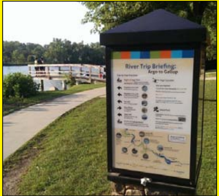
Water trail map

Actually, there are already many water trails in place around Michigan that you can go and explore. A great source for identifying them would be the Michigan Water Trails web site ( http://www.michiganwatertrails.org/default.asp ). But, still...just what are the bits and pieces that make up an official water trail compared to just getting out and paddling down some river like the AuSable or Pine Rivers up north. They have well identified landings and even camping sites along the way but are they official water trails? Well, to my