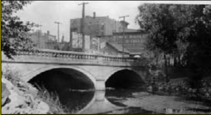
Bridge in 1914 Downtown Jackson