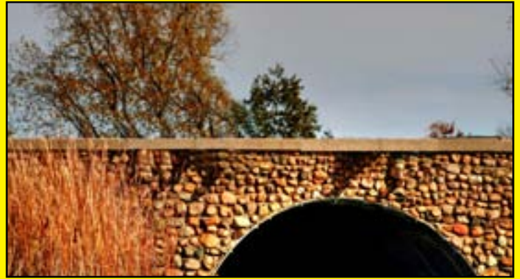
Napoleon Rd. between Olcott Lakes