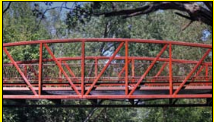
Walking Bridge over Grand River at Lions Park