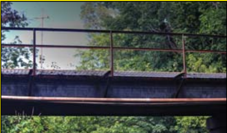
Railroad Bridge over Grand River between E. Morrell and Lewis